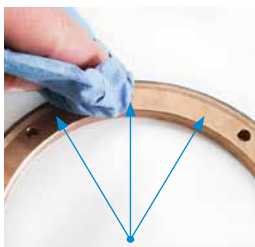
Carefully clean the contact surface of the HYLAS wheel.