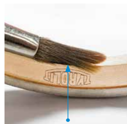
Grease the internal surface of the bore.