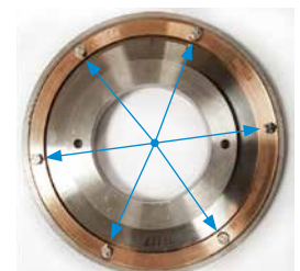
Fix the screws tightening torque of 3,4 Nm.