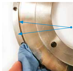
Carefully clean the contact surface of tool holder.